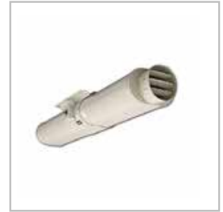
Oval Smoke Jet Fan