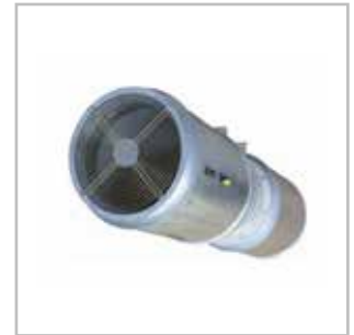
Fumax Fire Smoke Extraction Fan