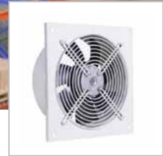
KDAXIS Wall Mounted Axial Fan