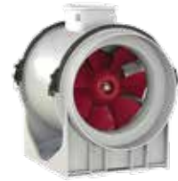
Lineo Inline Tube Fan

Our range of fans are specifically designed and used in various applications to meet customer requirements.