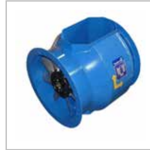
Majax-2 Bifurcated Cased Axial Fan

We have our range of fans suitable for the extraction of smoke in industrial kitchen extraction applications