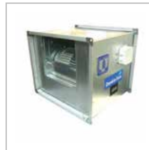
VFC Rectangular In-line Fan