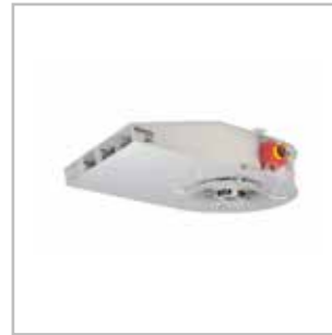
Cent Jet Centrifugal Smoke Jet

We offer fans certified in accordance with BS EN 12101-3:2002 Part 3 for 300°C for 120minutes, as well as fans to be used for Car