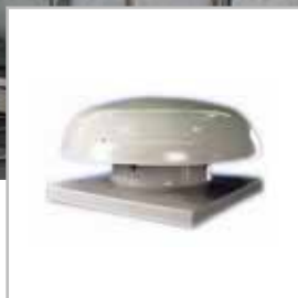
UV Horizontal Roof Mounted Fan