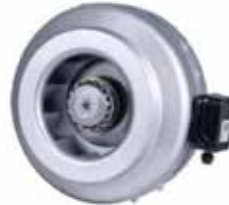
RAD In-line Fan