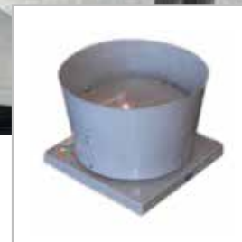
HVJ-2 Vertical Discharge Roof Fan