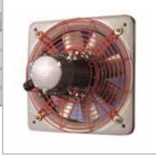
Bellax Wall Mounted Axial Fan