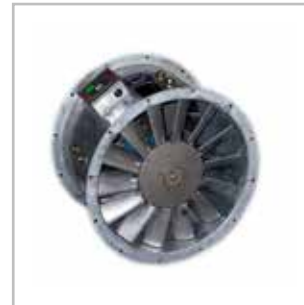
Maxflo Cased Axial Fan