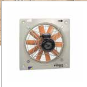
HC Wall Mounted Axial Fan