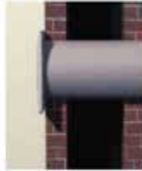
Punto Filo - Wall fan