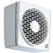
RAD In-line Fan