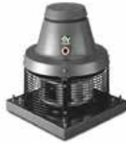
Tiracamino Fire Smoke Extraction Fan

We have a number of ventilation fans used in offices.