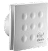
Punto Four Window Wall Fan