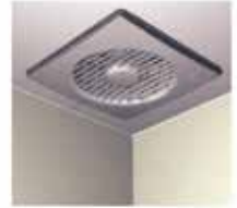
Punto Filo on - Ceiling fan