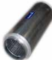
Sonax Tube Circular Attenuator