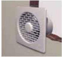
Punto Filo on - Wall fan

We have various types of domestic fans used in bathrooms, braai areas, general human cooling, and dehumidification.