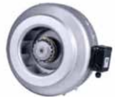
RAD In-line Fan