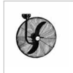
Airmax Wall Mounted Fan

Oscillating fans are an easy and affordable method of creating a draft in any area where some cooling is required. Our fan range can either be wall or floor mounted.