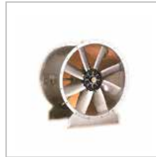
Fumax Fire Smoke Extraction Fan