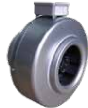
RAD In-line Fan