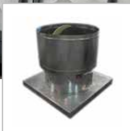
HVJ-2s Vertical Discharge Roof Fan