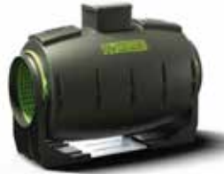
Lineo Quiet Inline Fan

In such areas it is important to have quiet running fans, we are able to offer our Silent Fans and also supply fans complete with attenuators/silencers in order to reduce noise generated by operating fans.