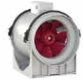
Lineo Inline Tube Fan

We offer various fans used in these spaces for ventilation.