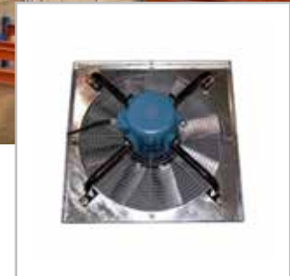
Maiax Plate Mounted Axial