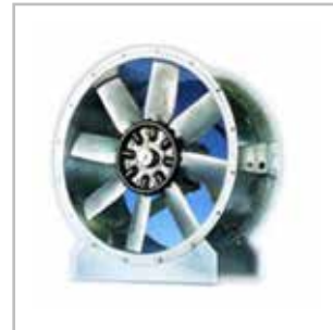
Majax-2 Cased Axial Fan