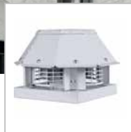
CRAD Roof Mounted Horizontal Mounted Fan