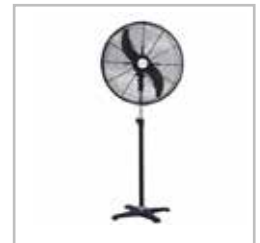
Airmax Pedestal Fan